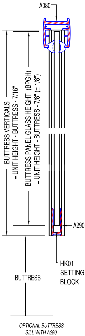
OPTIONAL BUTTRESS SILL WITH A290